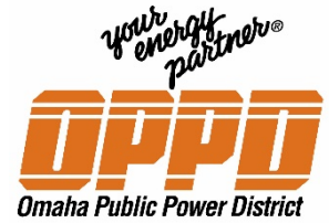
EXHIBIT A PRICING CERTIFICATE

This Certificate is delivered pursuant to Resolution No. [ ] of the Board of Directors of Omaha Public Power District (the "District") adopted on [MONTH] [DAY], 2021 ("Resolution No. [ ]"), which authorizes the issuance by the District of its Electric System Revenue Bonds, [2021] or [2022] Series [ ] (the "Bonds"). Capitalized terms used herein which are not otherwise defined shall have the meanings assigned thereto in Resolution No. [ ].