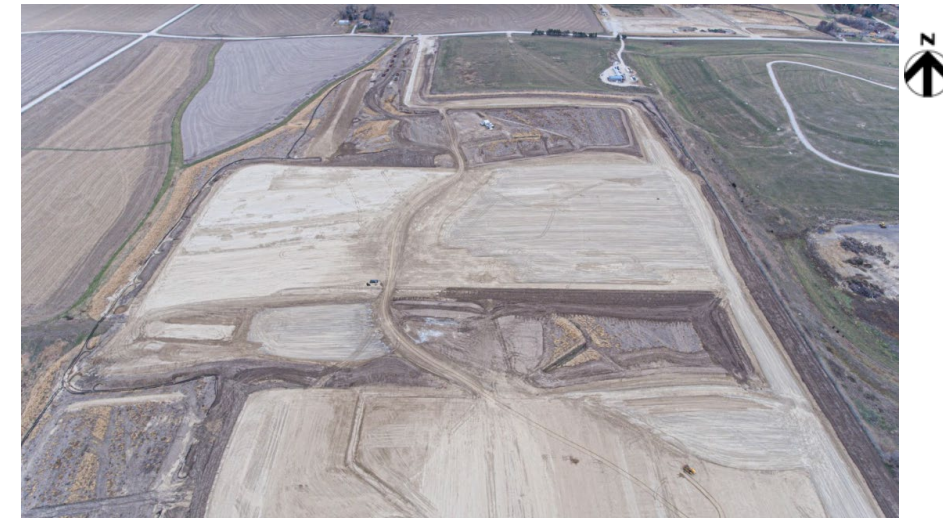
Turtle Creek Station