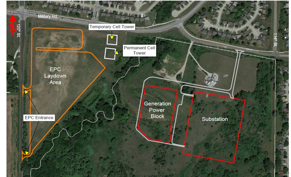
Standing Bear Lake Station