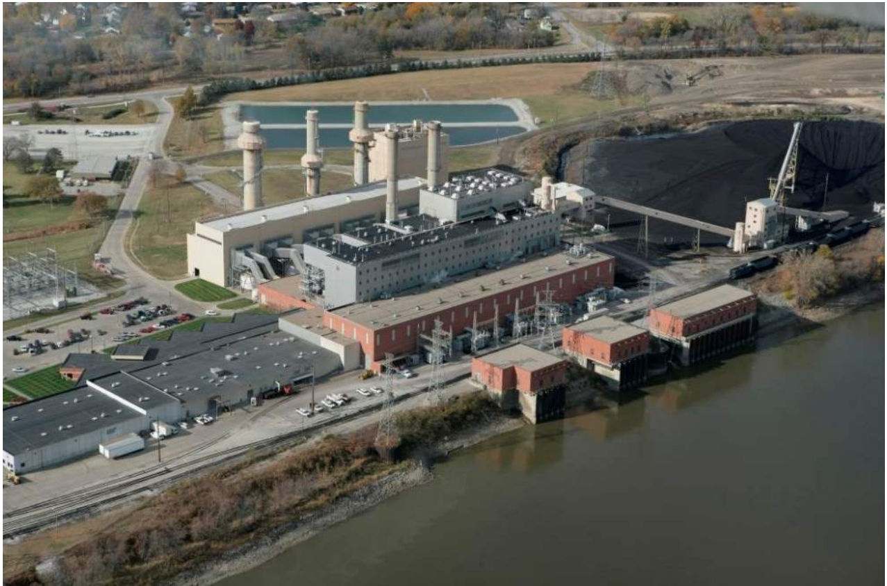
Omaha Public Power District North Omaha Station