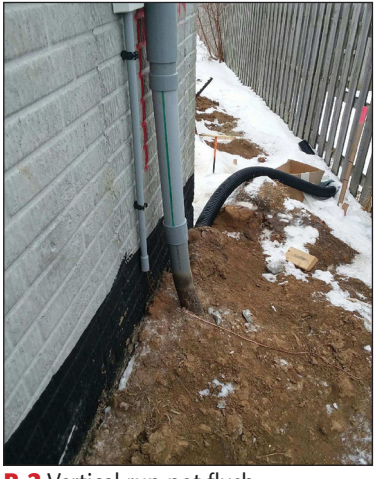
R-2 Vertical run not flush with the outside wall.

D-4 Duct cannot be heated to correct bend.