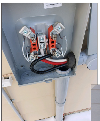
M-3 Riser/cable used knockout too close to home service.