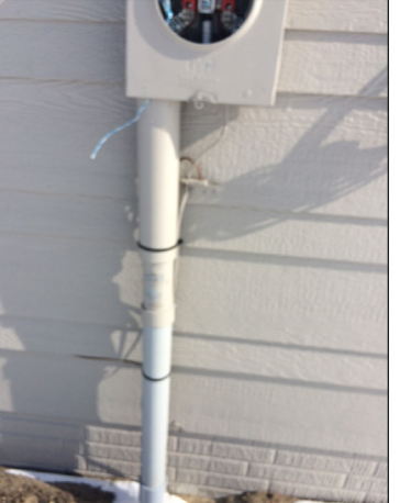
R-3 Expansion/slip riser setting is over four inches.