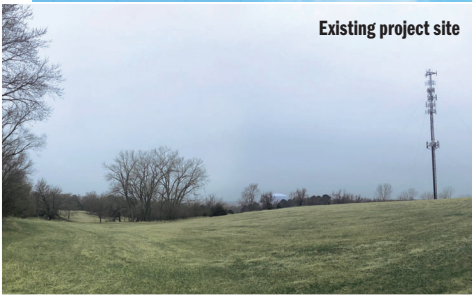
Existing project site