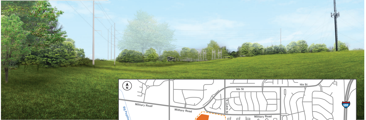
Facing southwest, an artist's rendering depicts the natural gas generation site located near North 120th Street & Military Road.