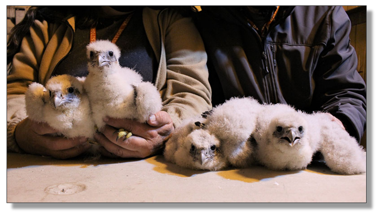
Video of the banding and story now featured on oppdthewire.com