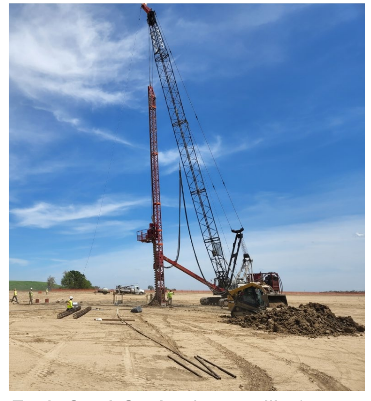
Turtle Creek Station (auger piling)