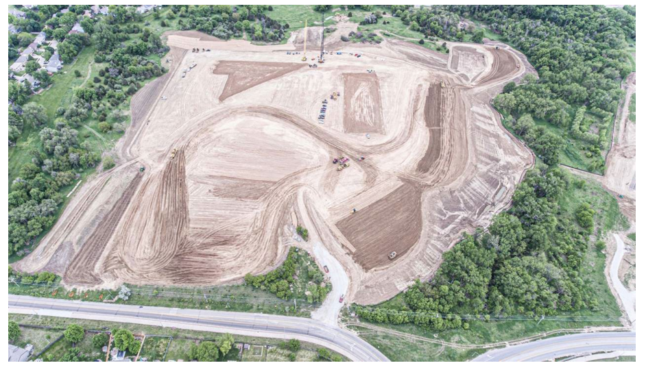
Standing Bear Lake Station (Looking South)