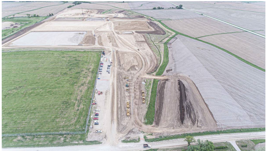
Information as of June 3, 2022 Turtle Creek Station (Looking South)