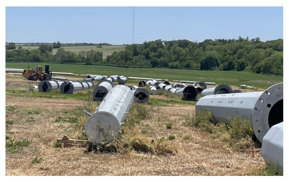
SSWTP Laydown Yard