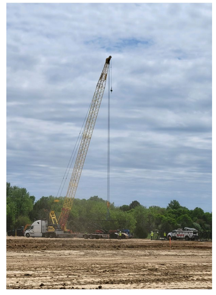
SBL Station (auger piling setup)

Turtle Creek and Standing Bear Lake Stations