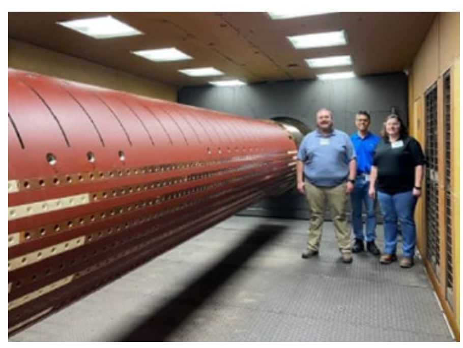
Siemens Generator Witness Testing