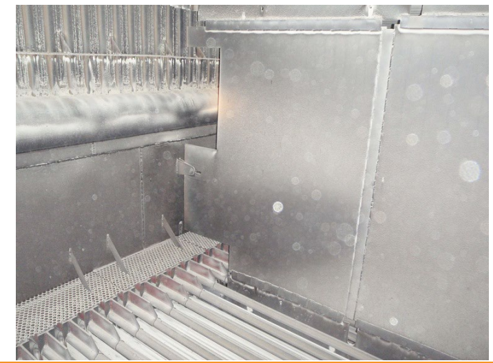
Nebraska City Station Unit 2 Boiler