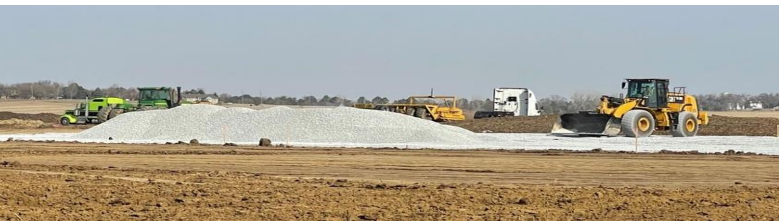
Platteview Solar - Site Readiness