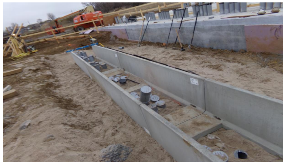
Facing Northeast - Substation Control House Duct Bank