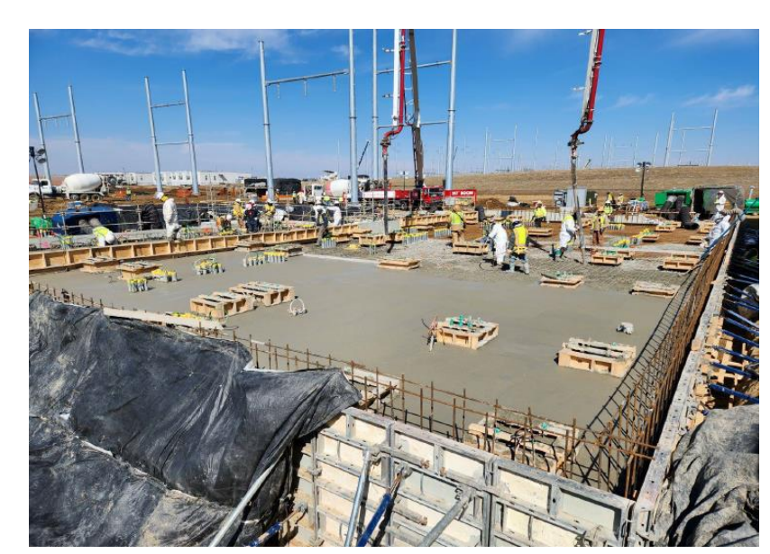
Facing Northwest – Power Distribution Center Foundation