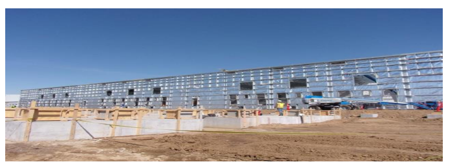
Facing Northeast - Engine Hall Enclosure