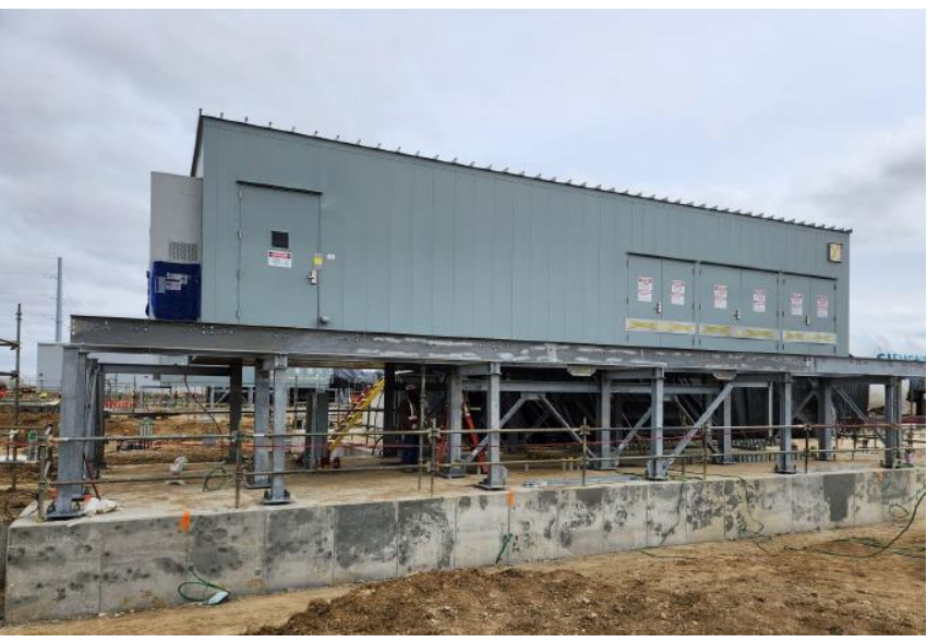
Unit #2 Electrical Package