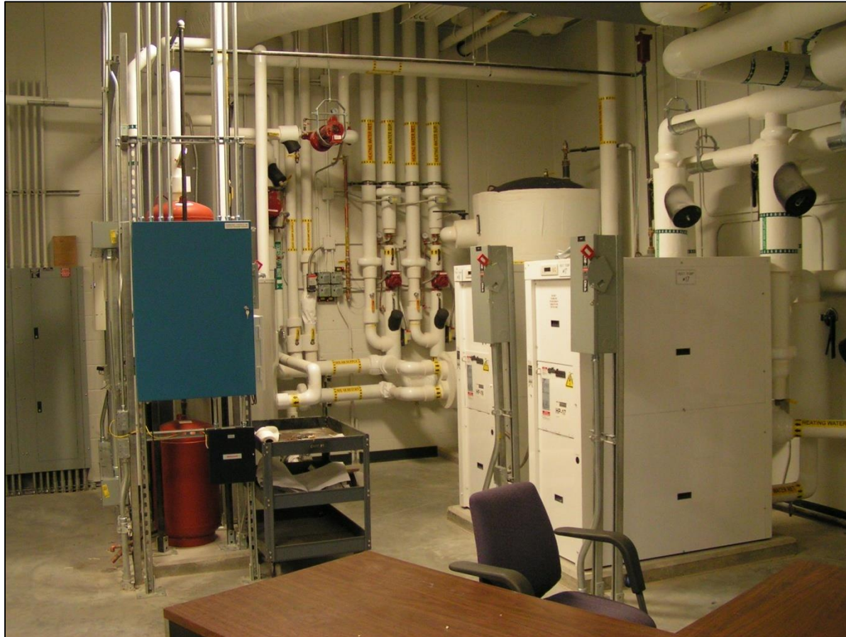
Water-to-water heat pumps, solar tank