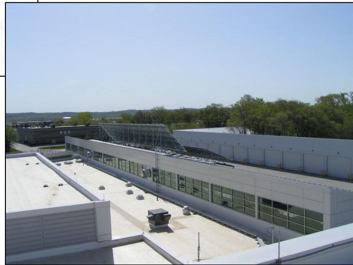
White (TPO) roof