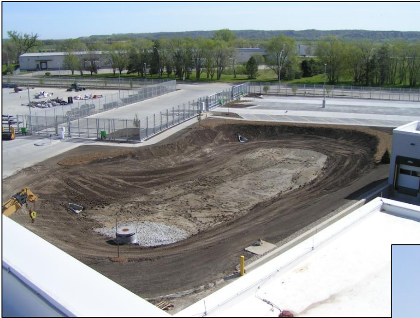
Stormwater detention pond (one of two)