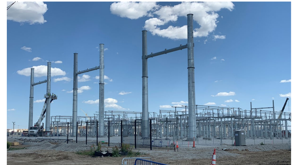
144 th and Capehart Substation