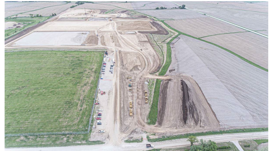
Information as of June 3, 2022 Turtle Creek Station (Looking South)