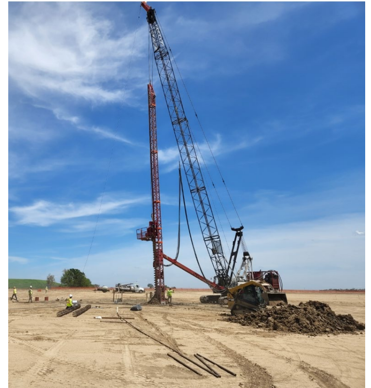
Turtle Creek Station (auger piling)