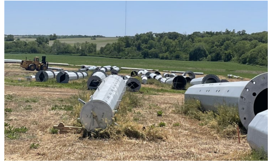
SSWTP Laydown Yard