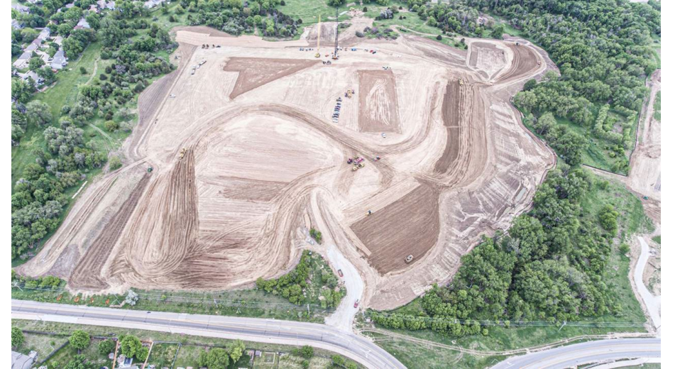
Standing Bear Lake Station (Looking South)