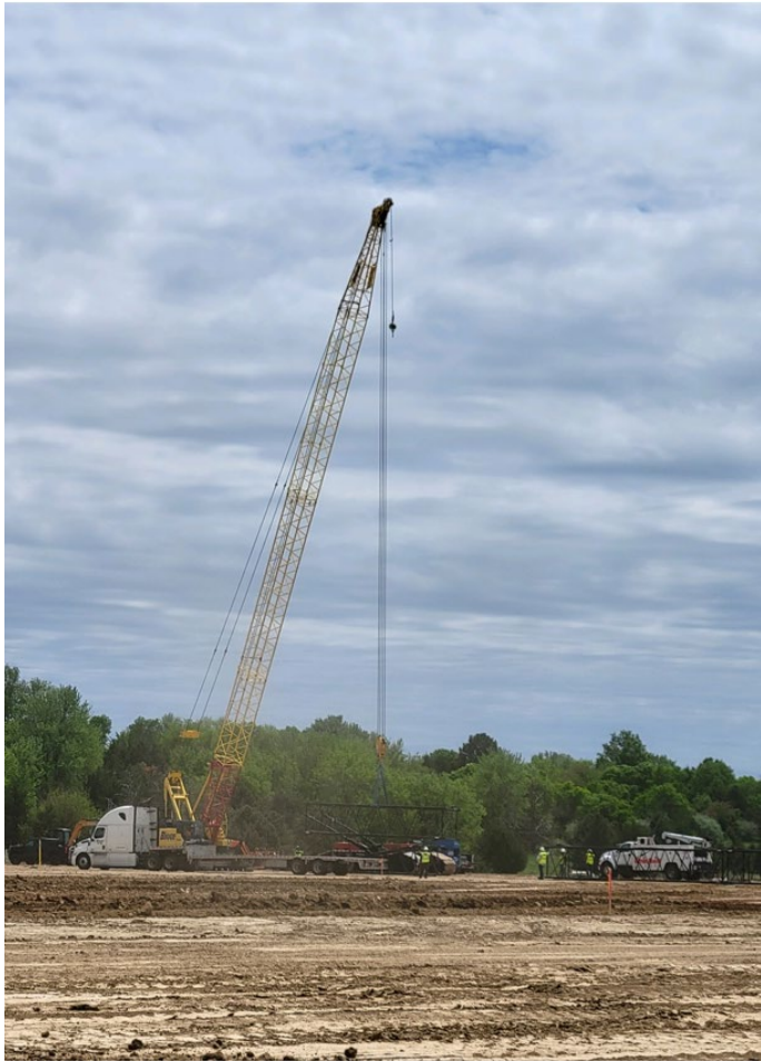
SBL Station (auger piling setup)