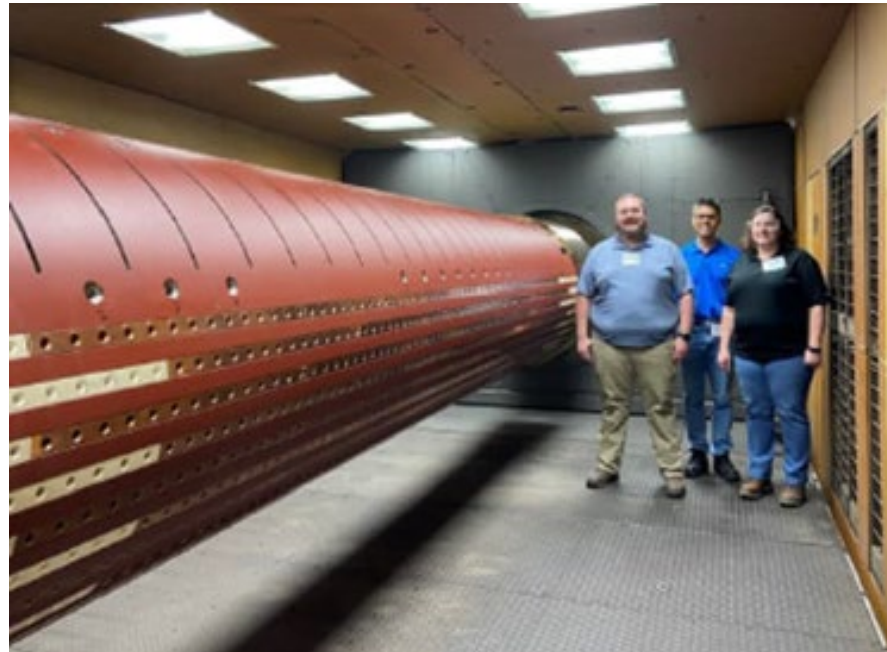
Siemens Generator Witness Testing